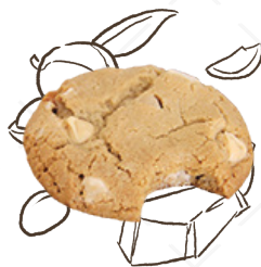
White Chunk Macadamia Nut