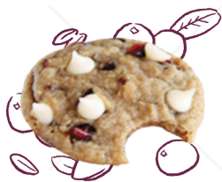
Oatmeal Cranberry White Chunk